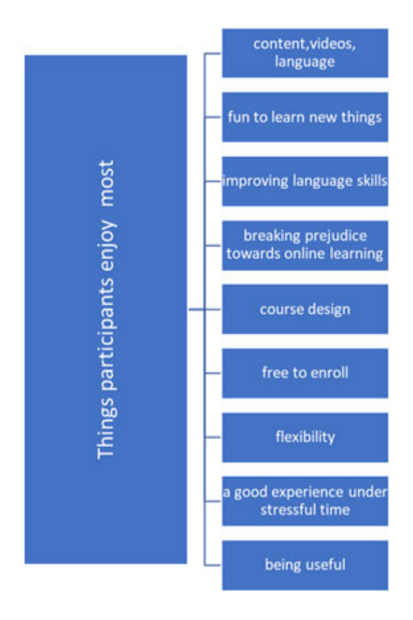
Figure 1: Things participants enjoyed most about MOOCs

To gain insight into participants' perspectives on their first MOOC experience, two open-ended questions were asked in an online post-survey. Each participant answered these questions. The responses to the first question, "What did you enjoy most about your MOOC experience?" were coded and categorised into themes. Figure 1 presents the codes, which were obtained from the participants' views.