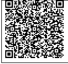
Figure 1: An example of a QR code

Uluyol and Agca (2012) introduced a text-plus-mobile model where 2D barcodes are encoded with web URLs, which host related animations, embedded in textbooks. Their results revealed that the participants in the text-plus-mobile phone condition had higher retention and transfer scores than the participants in other conditions. They also found significant differences between the text-plus-mobile phone condition and the text-only and text-plus-picture conditions on retention and transfer scores. Agca and Özdemir (2013) used Microsoft Tag technology in conjunction with printed books to facilitate learning of English language as a foreign language. Their findings show that the environment created curiosity for students and made the vocabulary learning activity more attractive by motivating students in a positive way. A similar study was conducted by Liu, Tan and Chu (2010), who used QR codes and augmented reality in teaching English. QR codes have also been used in library systems where collections are coded into QR codes and made available as printed pamphlets or online on the library webpage (Ashford, 2010). Another application is to use QR codes in conjunction with GPS technology to deliver location-aware content to learners (Chin & Chen, 2013). Further, QR codes have been used in classroom noticeboards to provide students with additional information via the Internet (Chaisatien & Akahori, 2007).