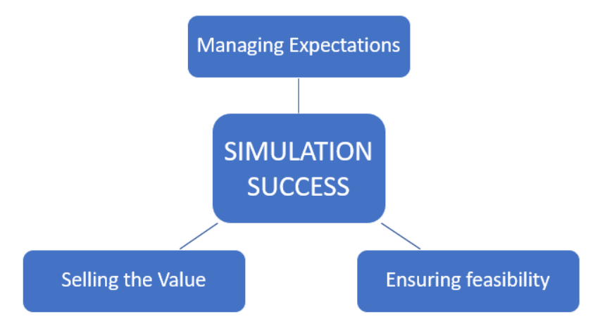
Figure 2: Factors for simulation success

strategy of a university. The success of future simulation-based learning activities requires attention to three things (see Figure 2).